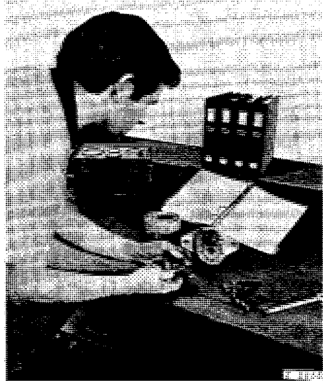
Use Technical Manuals for Actual Service

This technical manual is part of a twin concept of service: